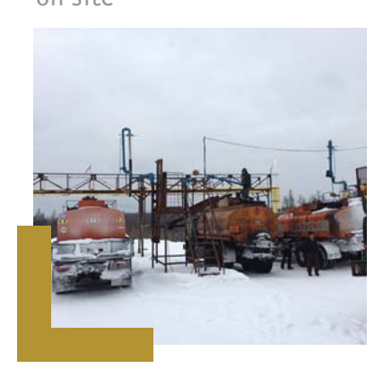
Taymura's oil loading station on site

A separate exploration license at Paiginskoye is owned by ETEK and the Russian State Committee of Reserves puts the reserves for the license at C1 category 5.3 million tonnes and C2 category at 1.6 million tonnes. The Chulokan license has no state registered reserves, although it is extremely promising given the available geological data.